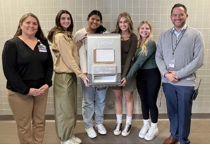
Students and administrators at Palisade High School prepare to install stocked dispensers donated by St. Mary's Medical Center that will provide free period products for students.