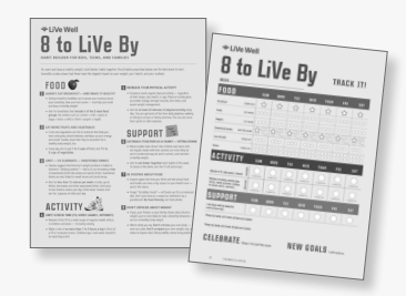
At IntermountainLiVe.org, you'll find lots of cool stuff like the 8 to Live By Habit Builder and Track It!