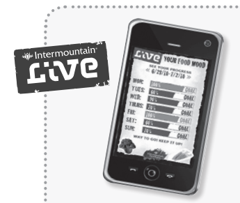
Look for Intermountain LiVe on the App store

We have an app for your phone, a cool website, and some handouts that can help boost you to the next level.