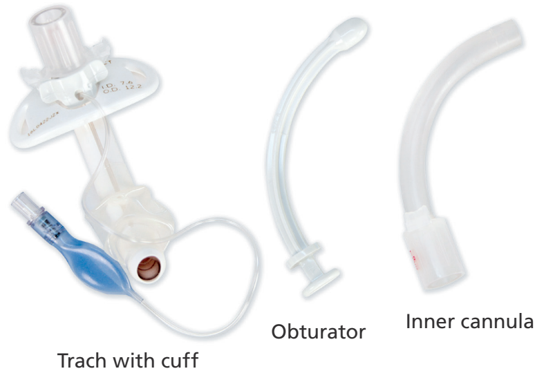
Trach with cuff