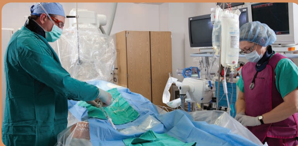
Logan Regional Hospital currently offers heart testing services and diagnostic heart catheterization services in the catheterization lab.

Patients requiring interventional cardiac treatment would no longer need to travel outside the valley for this service. Plans are underway to build two state-of-the-art fully digital catheterization labs at Logan Regional, and the hospital is currently working with the Intermountain Medical Group to recruit an interventional cardiologist to work with Logan's existing skilled cardiologists.