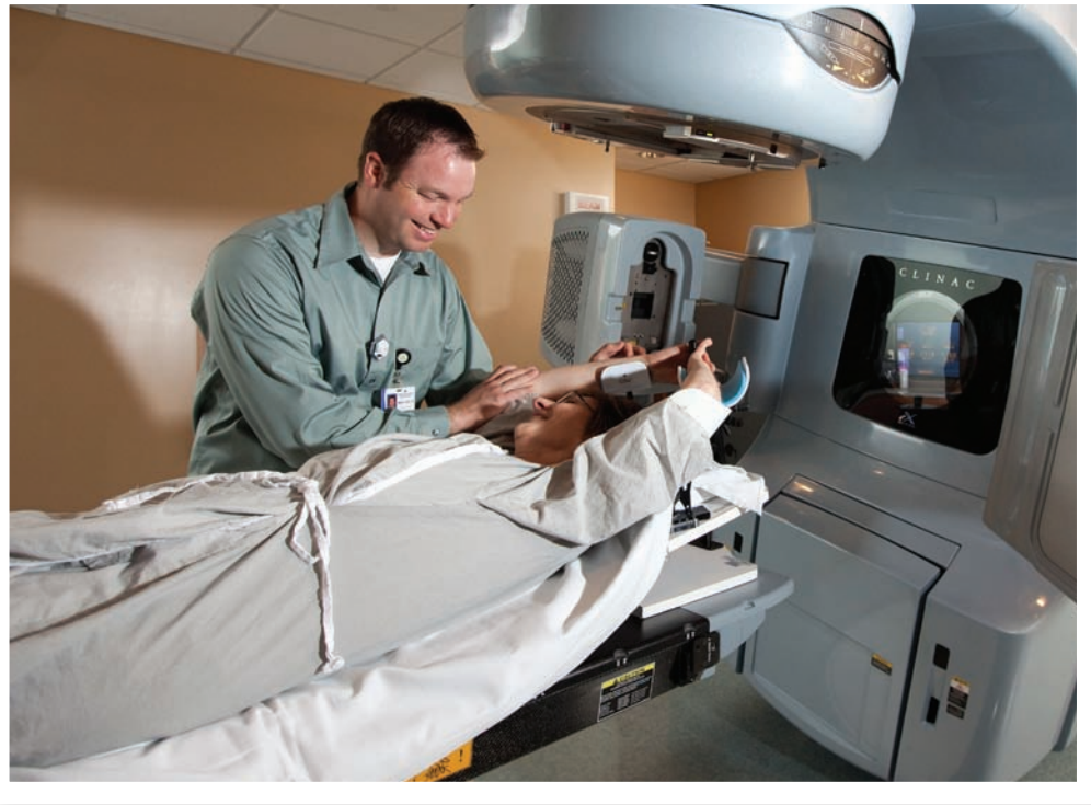
Logan Regional's Cancer Center has allowed hundreds of Cache Valley cancer patients to receive state-of-the-art radiation therapy close to home.

One example is the Logan Regional Cancer Center that the community helped to build through donations to the Foundation. Cancer patients who previously had to travel to Ogden or farther to receive radiation therapy can now get therapy right here at the center.