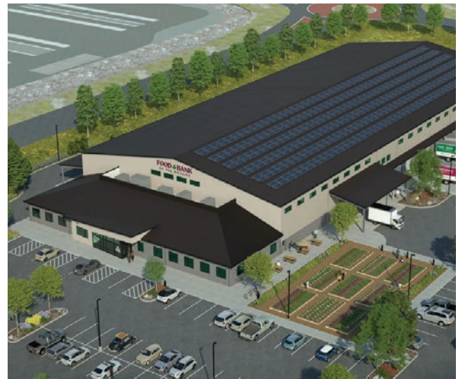
The new Food Bank of the Rockies location will be a 50,000 square foot warehouse that will include a state-of-the-art commercial kitchen for St. Mary's Meals on Wheels Mesa County.

Meals on Wheels Mesa County anticipates that in this new space, they will have the flexibility to increase their daily meal service from 600 to 1,000 hot meals each day.