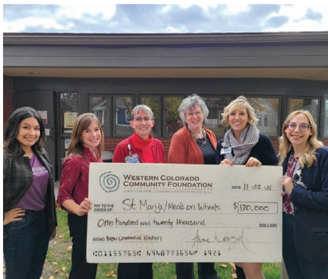
The Western Colorado Community Foundation committed $120,000 from several of their donor funds to help purchase equipment for the new Meals on Wheels kitchen.

The new warehouse and food distribution center is currently under construction with plans to move in by summer of 2022.