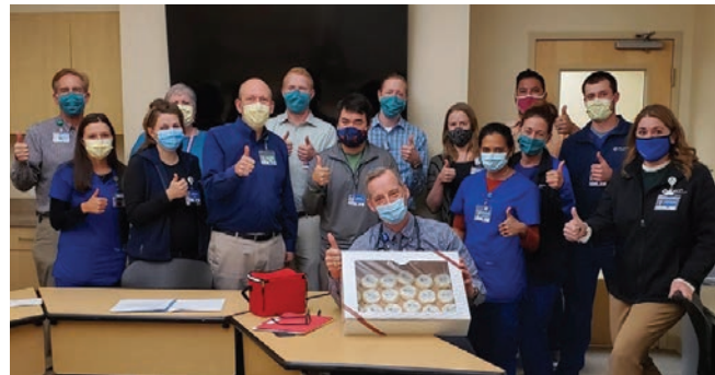
Members of St. Mary's Cancer Center Team celebrate receiving a Circle of Care recognition