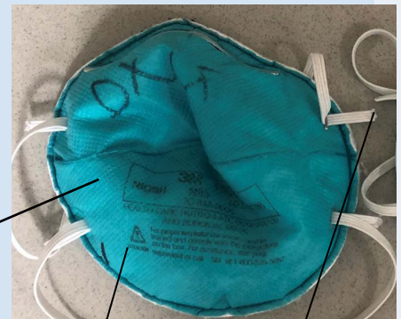
Damaged (stretched-out or broken strap, nose clip)