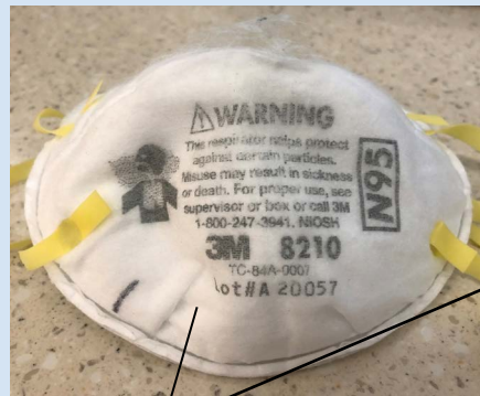
Doesn't retain shape