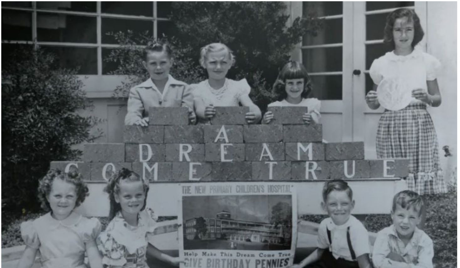
From the archives: Young donors support the Primary Children’s Avenues Hospital construction.