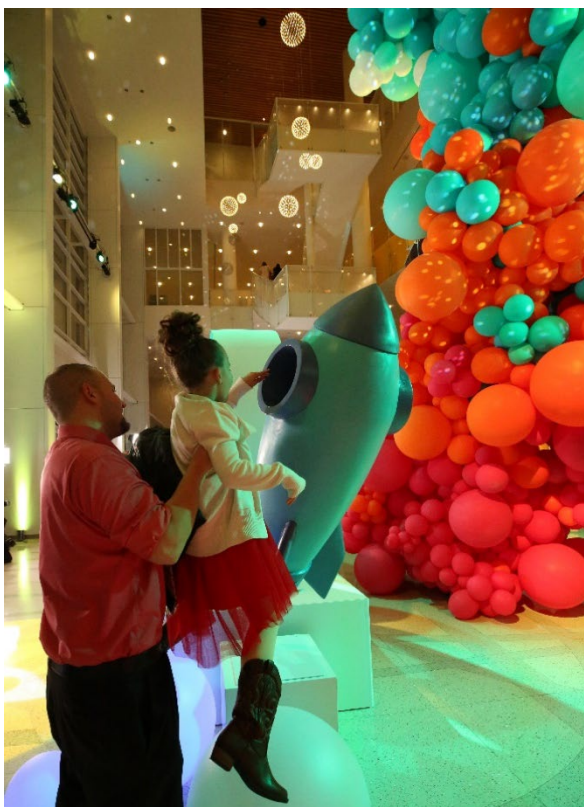
Family leaving a note in Primary Promise rocket time capsule