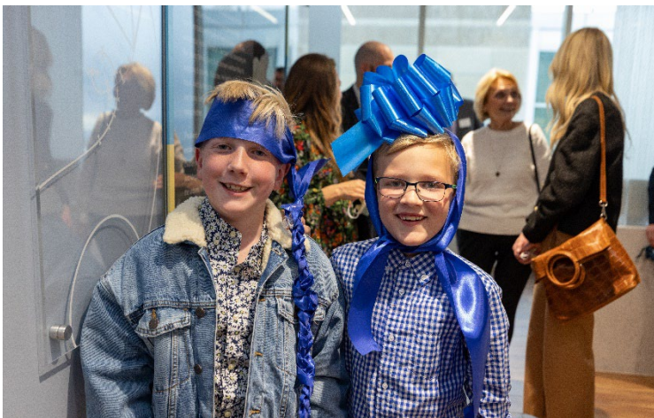
Bonham sons - Two Bonham boys remember their brother