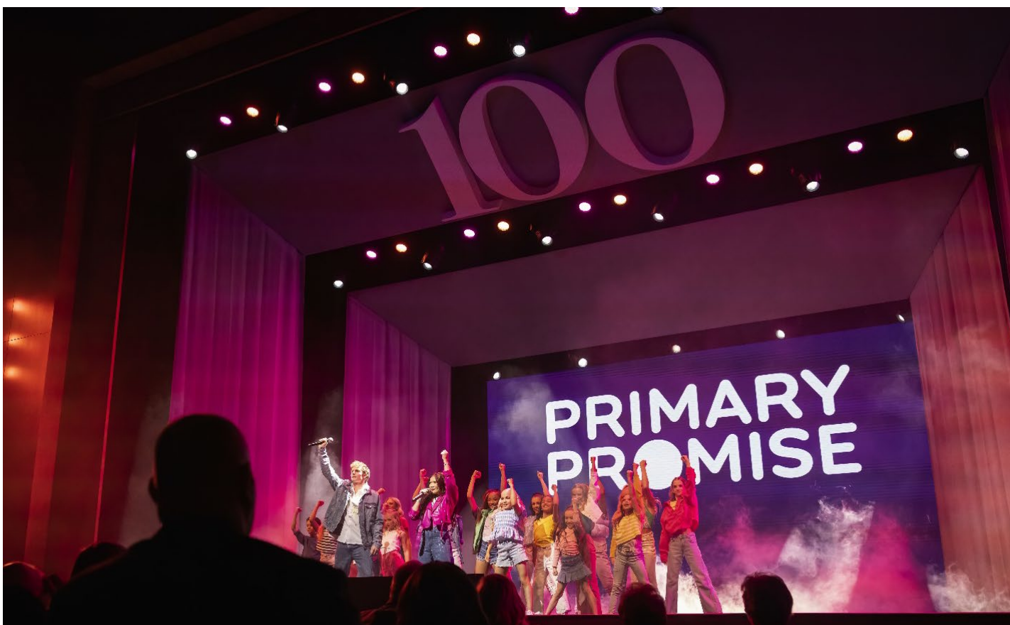
Live performance by Center Stage Performing Arts Center, celebrating the Primary Promise vision