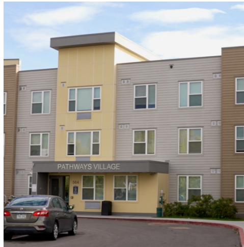
St. Mary's gave $300,000 to help its long-time partner, Homeward Bound of the Grand Valley, build the Pathways Family Shelter.