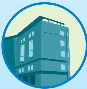
Good Samaritan Medical Center LAFAYETTE, CO