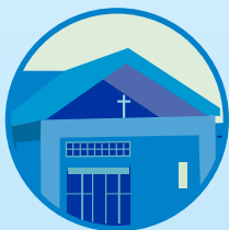
Holy Rosary Healthcare MILES CITY, MT

*These numbers include clinic contributions not included on 990 schedule H