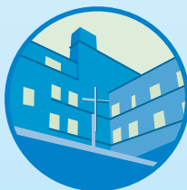
St. James Healthcare BUTTE, MT