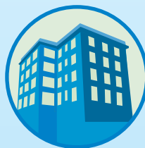
St. Vincent Healthcare BILLINGS, MT