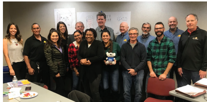
Local MHFA training

SCL Health expanded the reach of its resources even further by developing new relationships with community organizations like The Master's Apprentice – a Denver-based pre-apprentice program for individuals in the