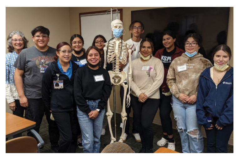
High school students from Manual and West high schools in Denver are completing Certified Nurse Assistant training at Saint Joseph Hospital, readying them for careers in health care.

These students, many of whom are first generation high school graduates, are participating in a custom training program that will position them to work at Saint Joseph Hospital and