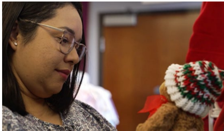
The Baby Bootique supports vulnerable families who want to ensure a healthy and equitable start for their babies. The program outcomes have reduced the cost of care, improved health habits, decreased stress for families, and increased opportunities for newborns to attain their highest level of health.

Annually, 300 to 400 patients receiving prenatal care at Uptown Community Health Center and Marisol Health (a program of Catholic Charities) are participating in the program. Outcomes are promising. In Colorado, an average of 9.4% of babies born had a low birth weight, but the average for program participants is 8.9%.