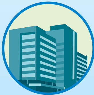
St. Mary's Medical Center GRAND JUNCTION, CO