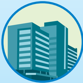
St. Mary's Medical Center GRAND JUNCTION, CO