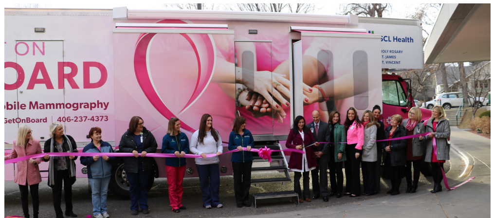
Ribbon cutting ceremony for new mobile mammography coach

This program addresses rural barriers to preventative care, including lack of transportation, cost of travel and screening, fear, cultural barriers and inconvenient clinic hours by bringing services to communities where they do not currently exist. Few rural healthcare facilities in our region are able to provide mammography services; thus