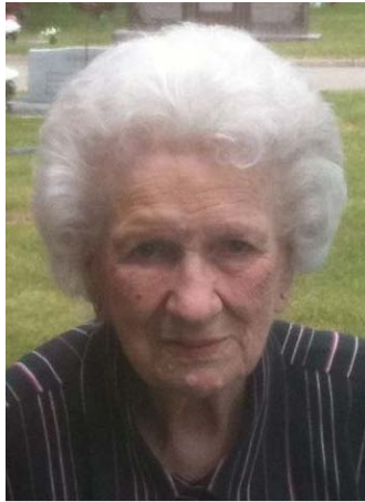
Celebrating our Centenarians