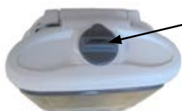
Battery door knob