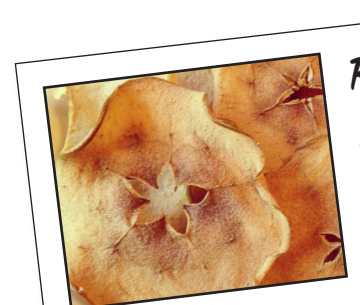
Prep time: 15 min Cook time: 45 minutes